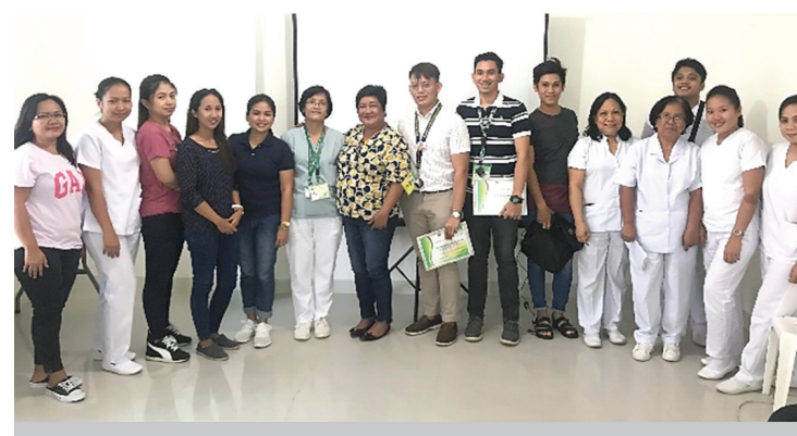
e organizers from NSC-NL and the nurse-trainees from Gaoat General