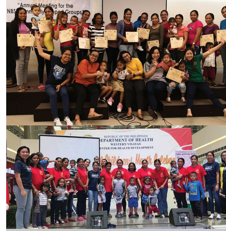
ordination with the NBSCC Western Visayas and NIH-IHG. Bottom: Official launching of the CH support group in Eastern Visayas on Vovember 24

On November 24, the support group for the CH was officially launched during a mall-based celebration of the Nationa Children's Month. The NBSCC shall oversee the activities including plans for information dissemination in the community Top: Participants and organizers of the FGD held on November 14, 2019, in and annual meeting with the parents.