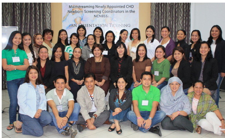
The new CHD Nurse Coordinators and organizers of the orientation training

The hiring of a NBS nurse coordinator in each CHD was an outcome of the consultative meeting conducted with DOH which identified the lack of human resource as a major constraint in attaining the target on NBS coverage. Following the said consultative meeting in October