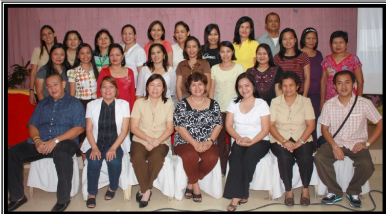
Organizers and participants to the LGU Assembly in SOCCSKSARGEN (top photo) and Eastern Visayas (lower photo)