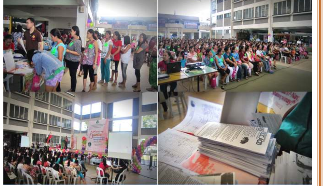
Araw ng Buntis 2102 in Mindanao: Ateneo de Davao Grade School Campus, Davao City