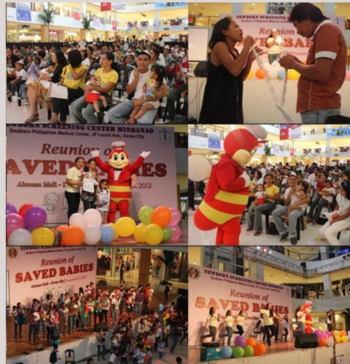
An afternoon of fun. laughter, games and NBS family bonding at t

Reunion of Saved Babies in Davao City was a day of fun and