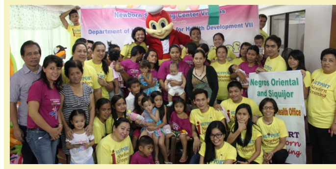
The saved children with their parents pose with the organizers and Jollibee mascot after series of games, intermissions and ice breakers.

DUMAGUETE CITY- In cooperation with Dumaguete City Health Office, Newborn Screening Center-Visayas in partnership with Center for Health Development-Region 7 (CHD-7) organized the 1st Reunion of Saved Babies for the Provinces of Negros Oriental and Siquijor on October 27 at the City Health Office's Conference Room.