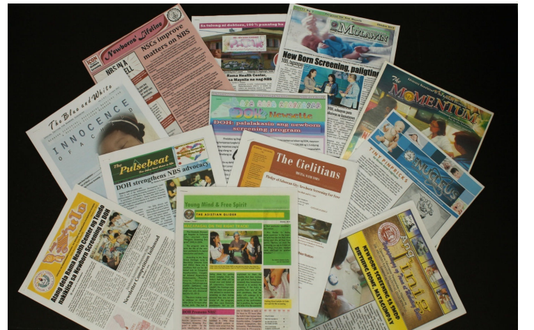
Twelve (12) entries for the Newsletter Competition launched by the CHD-MM for secondary schools in Manila, Parañague, Caloocan and Quezon

(12) entries were selected for the final judging.