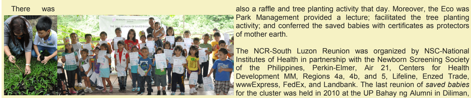
The saved children show their certificate as protectors of mother earth Quezon City. after the successful tree planting activity.

QUEZON CITY - Forty (40) saved babies and their parents were gathered on October 28 (Sunday) at the Superferry Pavillon of the La Mesa Eco Park for a program filled with fun and prizes. To make it more meaningful, the organizers aptly dubbed the event "Saved Babies Help Save Mother Earth". Volunteers from VYLH-Philippines NCR-South Luzon participated in the activity as the event's emcees. The group also presented a Filipino children's story entitled "Si Emang Engkantada at ang tatlong batang makulit" through participative storytelling in which the children played a part in the story's delivery and learn about environmental conservation simultaneously.