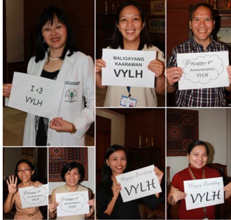
Supporters and partners of VYLH Philippines flash fan signs, greeting the Network on its fourth founding anniversary.

uly 18, 2009, a spark ignites. July 18, 2013, four years after, VYLH Milestones the Volunteer Youth Leaders for Health (VYLH) is now a