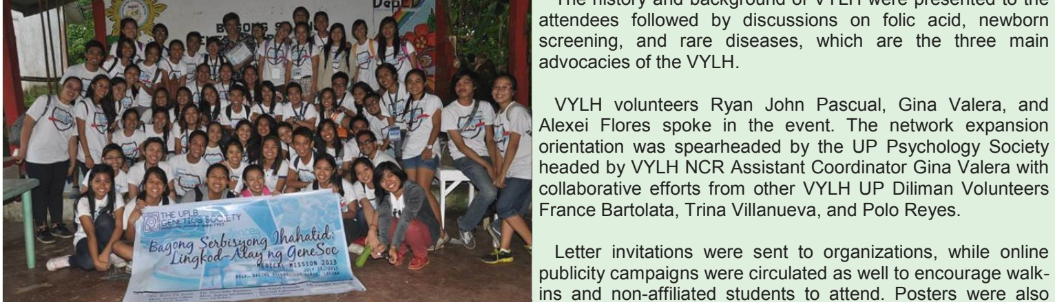
embers of the UP Los Baños GeneSoc reaches out to the community through