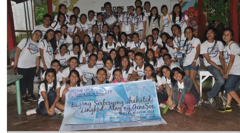
Medical Mission 2013, in partnership with VYLH Philippines.

Early detection results in the prevention of the consequences of untreated conditions.