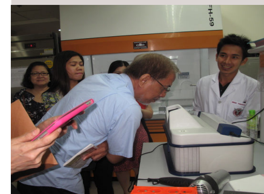
Above: Representatives from different hospitals walked through the NBS process during the series of meetings organized by CHD-MM in April and May.

During these meetings, the overview and the NBS flow of operations were