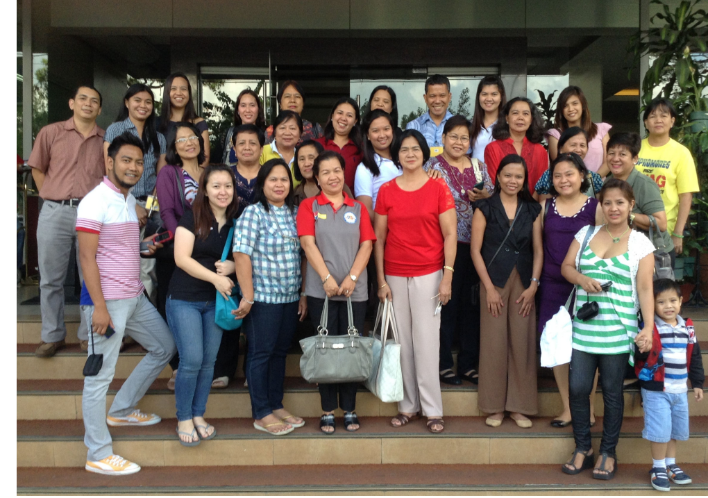
Above: Participants of CHD–Region IV-A strike a pose in front of Burnham Suites, Baguio City, the venue of its 2013 PIR.