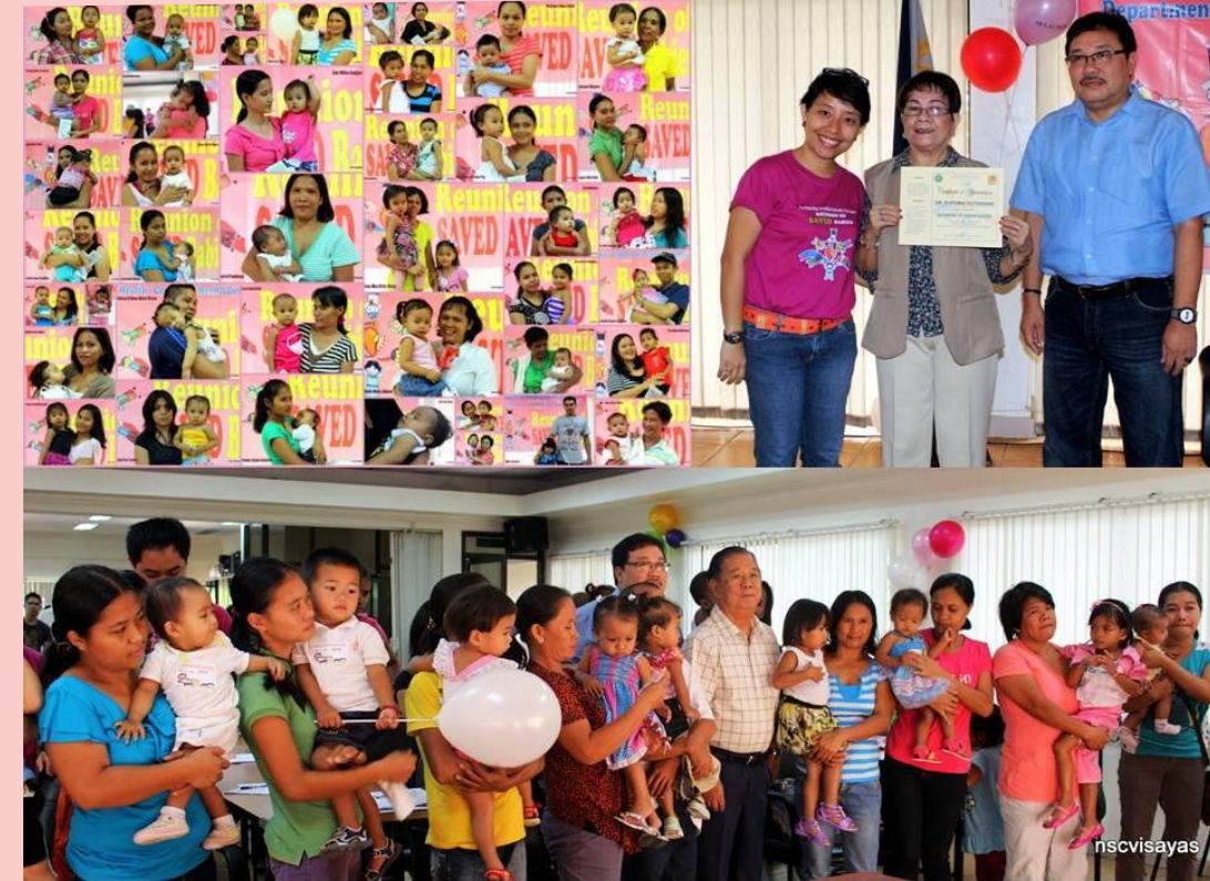
Above: Parents, saved babies and the newborn screening team celebrated the Reunion of Saved Babies on March 26 in Negros Occidental.