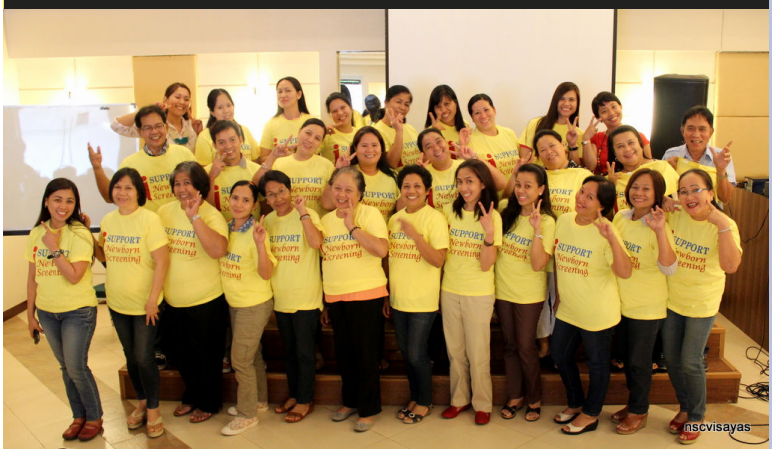
Participants from the hospitals in Negros Occidental strike a pose for a "wacky shot" during the NBS Reorientation Program in Bacolod City.

To offer better newborn screening (NBS) service in the region, Newborn Screening Center (NSC)-Visayas and the Centers for Health Development implemented the Newborn Screening Reorientation Program, which would help newborn screening facilities (NSFs) reinforce basic knowledge of the NBS program and its process.