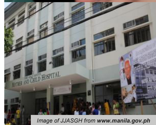
Image of JJASGH

The Department of Health accredited the JJASGH in 2010, hence integrating all the public health programs into the hospital's policies including the Newborn Screening Program.