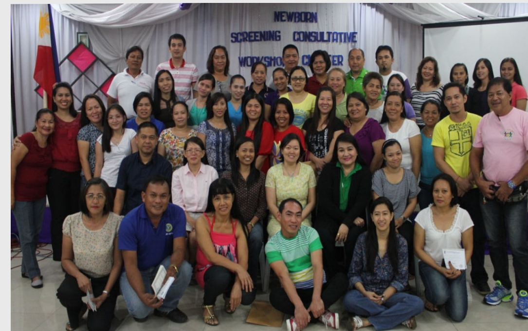
Staff of the Zamboanga Peninsula NSF's meet for a Cluster Meeting gather in Pagadian City.