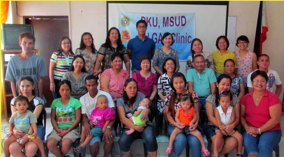
Saved babies and their families mingle with NSC-Visayas and CHD staff during a reunion in Cebu City.

In numbers, the attendees were composed of 11 PKU patients, 5 Galactosemia patients, and an MSUD patient. Medical specialists, pediatricians, dieticians, and follow-up nurses from referral health facilities also graced the event. YCDemegillo