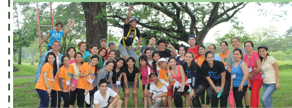
NSC-CL staff pose for photo after completing the challenges prepared by Lubid, Inc. in Pampanga.

The non-traditional outdoor activities brought out among the staff character, solidarity, and confidence, which are necessary values for NSC-CL organizational development. Furthermore, these experiences deepened their commitment in being part of a high-performing team.