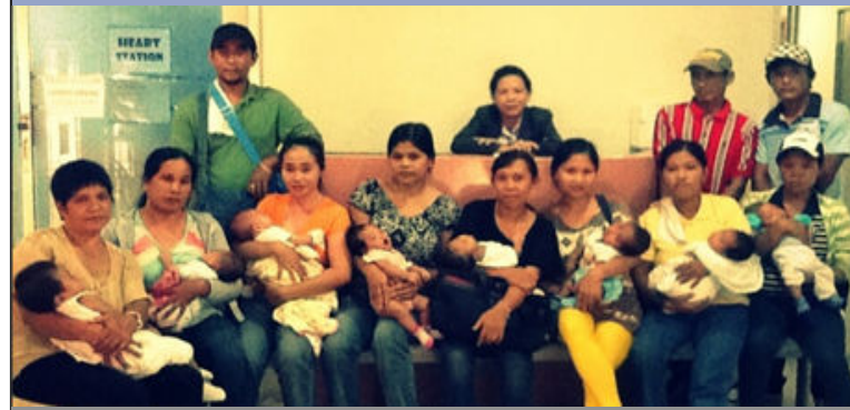
Mothers and their babies find refuge in George Y. Yabes Maternity Home in Malalag, Maitum, Saranggani Province.