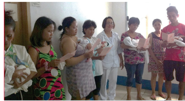
Expecting parents read the FAQs on newborn screening during one of their visits at Zamboanga del Norte Medical Center.