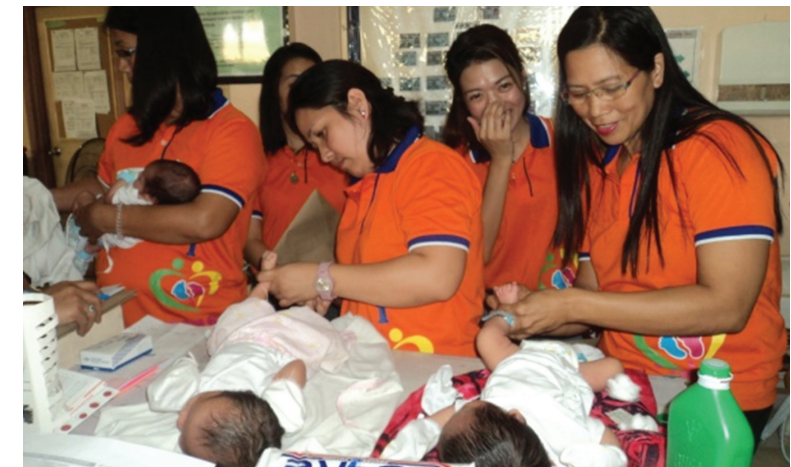
Participants from Batangas during one of the ENBS Orientation roadshows