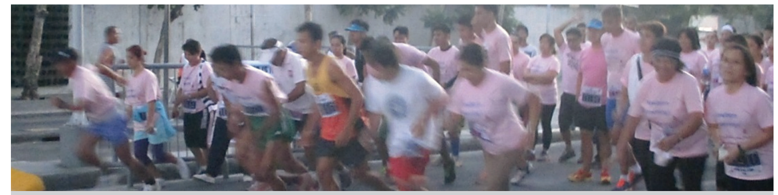
Participants dash from starting line during the Run for Cause in Naga City, November 14, 2016.

espite the postponement due to Typhoon Lando, the A D Run for a Cause: NBS Awareness Campaign finally hit the ground on November 14 and 21, 2016, in Naga City and Catanduanes, respectively.