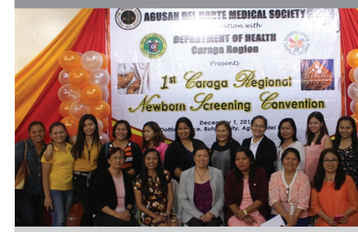
Participants and organizers of the DOH-CARAGA Regional NBS Convention.

eanwhile, selected NBS Coordinators of well-perfo cilities were invited on stage during the open forum to sh eir good practices, insights, and strategies in address ommon hurdles of program implementation. RAguilar