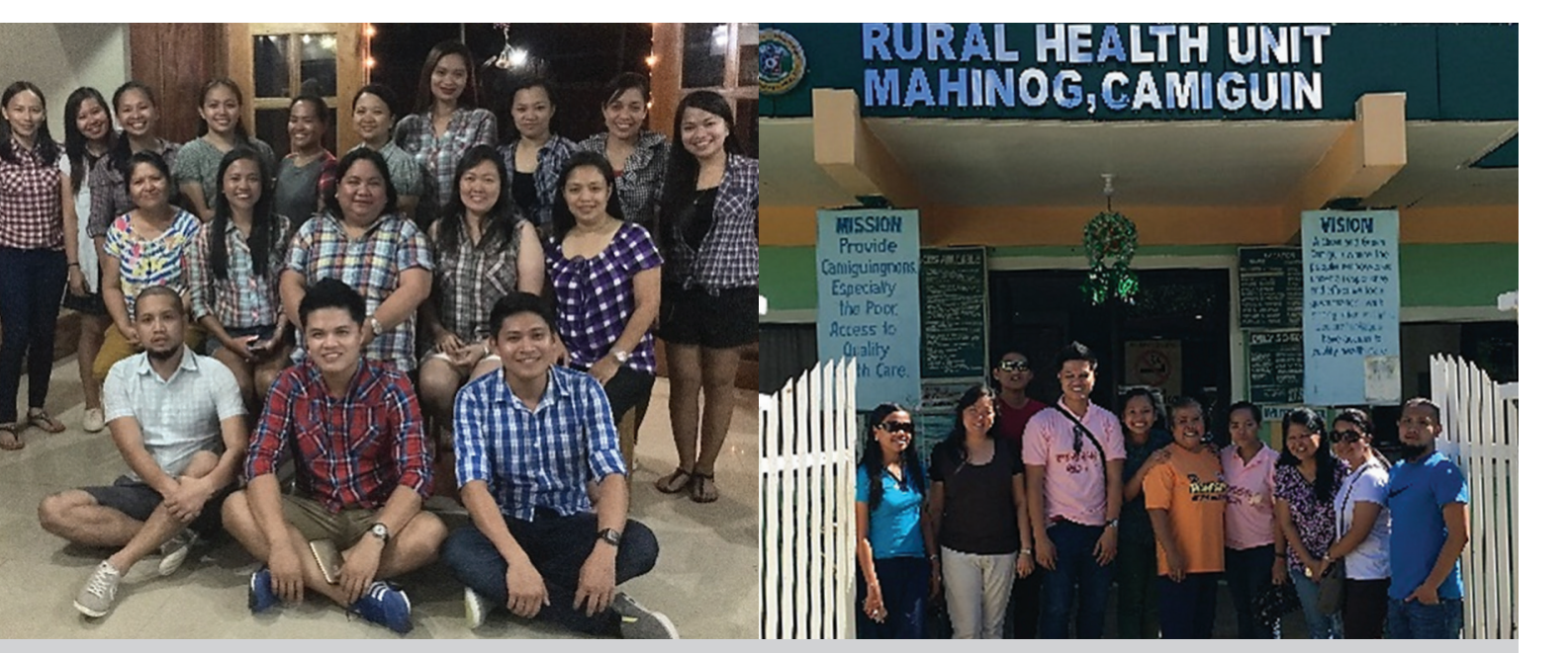
Participants together with the facilitators strike a pose during the consultative meeting.

On the second day, participants split up into two groups for facility visits in Camiguin. The facilities visited were RHU Catarman, Catarman District Hospital, RHU Sagay, RHU Mabajao, Camiguin General Hospitalm, and RHU Mahinog. Participants were exposed to the good practices of the said facilities.