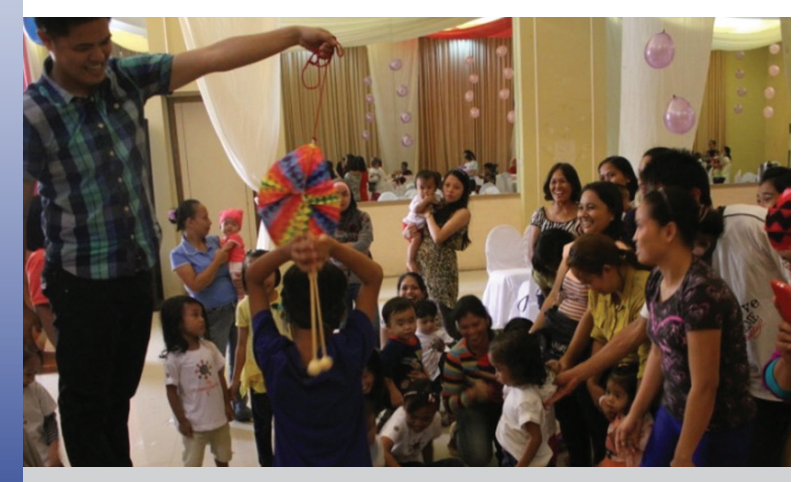
Parents and their children have fun during the Reunion of Saved Babies.

The reunion was organized by the Newborn Screening Center-Mindanao and Newborn Screening Continuity Clinic of Zamboanga City Medical Center to promote camaraderie and support among the families of saved babies. AJCalibot