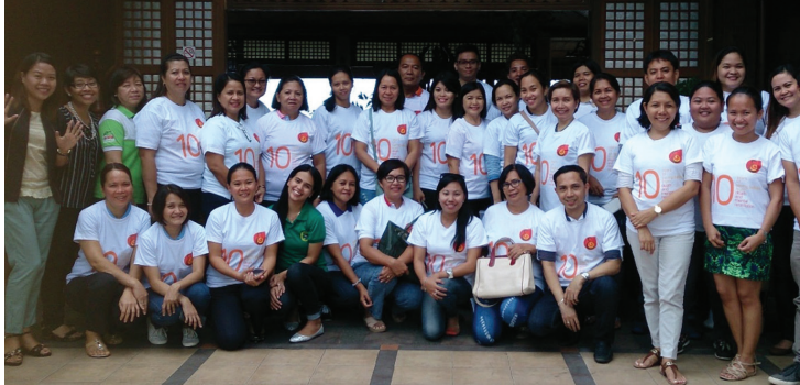
Personnel from active and newly registered NSFs in Southern Leyte participate in the NBS orientation in Maasin City.

o promote expanded newborn screening (NBS) and provide important updates on new NBS protocols, Newborn Screening Center (NSC)-Visayas, in partnership with the Department of Health-Regional Office 8, conducted the NBS Program Updates and Orientation on Expanded NBS in Maasin City. Southern Levte. on March 22, 2016.