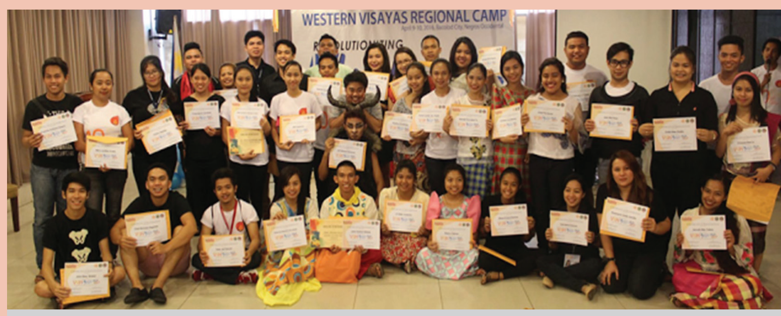
VYLH Philippines welcomes Batch Kabilin, pictured here in their cultural attire, during the Western Visayas Regional Camp in Bacolod Clty on April 9-10, 2016. Batch Kabilin is composed of participants from Negros Occidental and Panay Island provinces.

The Volunteer Youth Leaders for Health (VYLH) Philippines of neural tube defects, and the orphan disorders advocacy of welcomed Batch Kabilin, the newest batch of the Network's volunteer youth leaders, during the Western Visayas Regional Camp held at Bacolod Pavilion Hotel on April 9-10, 2016.