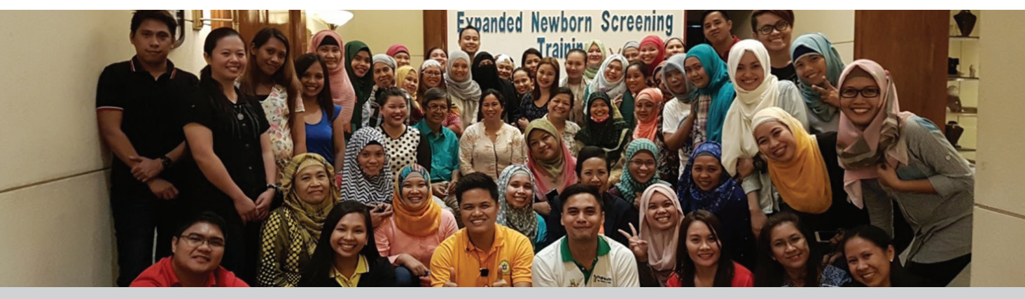
Participants and facilitators of IPHO Maguindanao's ENBS Orientation and Training.

he Integrated Provincial Health Office (IPHO)-Maguindanao, together with Newborn Screening Center (NSC)-Mindanao, organized an orientation on Expanded Newborn Screening (ENBS) for health service providers at Marco Polo, Davao City, on April 26-28, 2016.