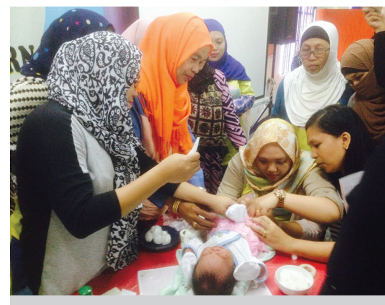
Participants of the NBS orientation for Lanao del Sur receive a quided, handson training on newborn screening.

Currently, Lanao del Sur has all 5 district hospitals and 30 of the 39 rural health units as NBS facilities. The training of additional health workers under these facilities aims to provide an improved health care service to the Lanao del Sur populace. ADescaller