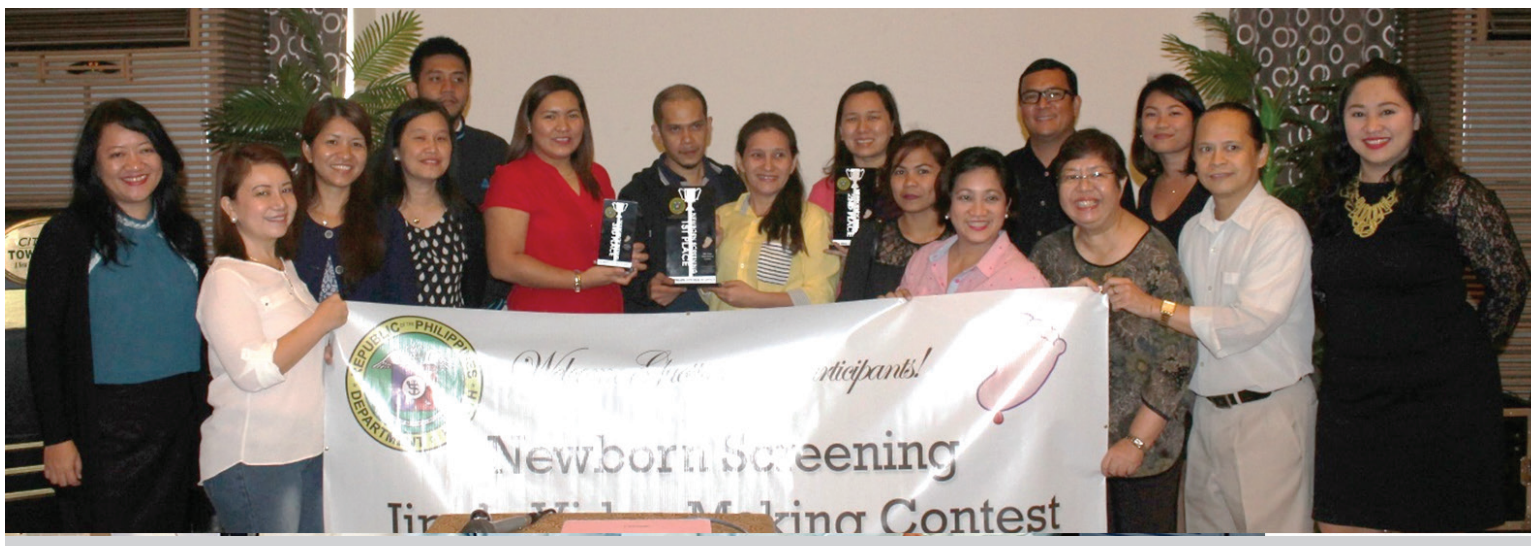
Representatives from the winning helath offices from local government units-Muntinlupa, Las Piñas, and Valenzuela City Health Offices-receive their trophies and join the officers and staff of DOH-NCRO, NSRC, and NSC-NIH.

n 2014, the Department of Health–National Capital Regional Office (DOH-NCRO) commissioned a song/jingle for the newborn screening (NBS) to extend the reach of the program. The jingle was such a hit that it is being played in almost all NBS gatherings including the national convention.