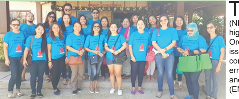
Participants of the zonal planning workshop wearing their batch shirt

The Department of Health–Regional Office 12 conducted two-day zonal planning workshop at Isla Jardin Del Mar, Glan, Sarangani, on November 28-29, 2016. It was attended by the regional program managers and nurse coordinators within the Mindanao cluster, which is composed of (Regions 9, 10, 11, 12, Caraga, and ARMM).