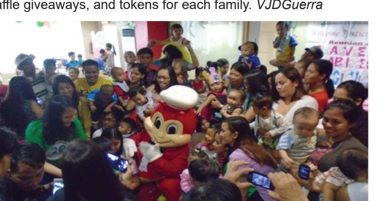
Counterclockwise: (1) Children from Cavite Province play parlor games. (2) Parents from Quezon Province enjoy games prepared for them as well. (3) Kids flock to the mascot for photos in Laguna Province.

Participants were treated to games, mascot performances, raffle giveaways, and tokens for each family. VJDGuerra