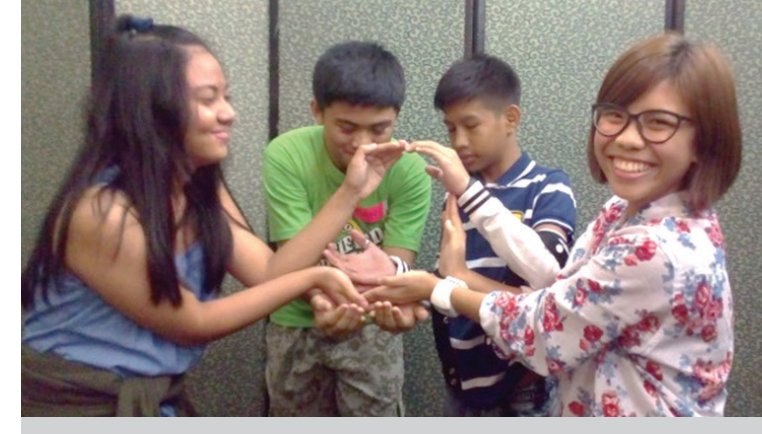
Patients play charades during the reunion in San Juan City.

Elan Hotel Modern, San Juan City, on November 26, 2016. The activity was attended by patients and parents of confirmed cases of Glucose-6-Phosphate Dehydrogenase (G6PD) Deficiency, Congenital Adrenal Hyperplasia, Congenital Hypothyroidism, Galactosemia, and Phenylketonuria. This year's reunion focused on social interaction among participants