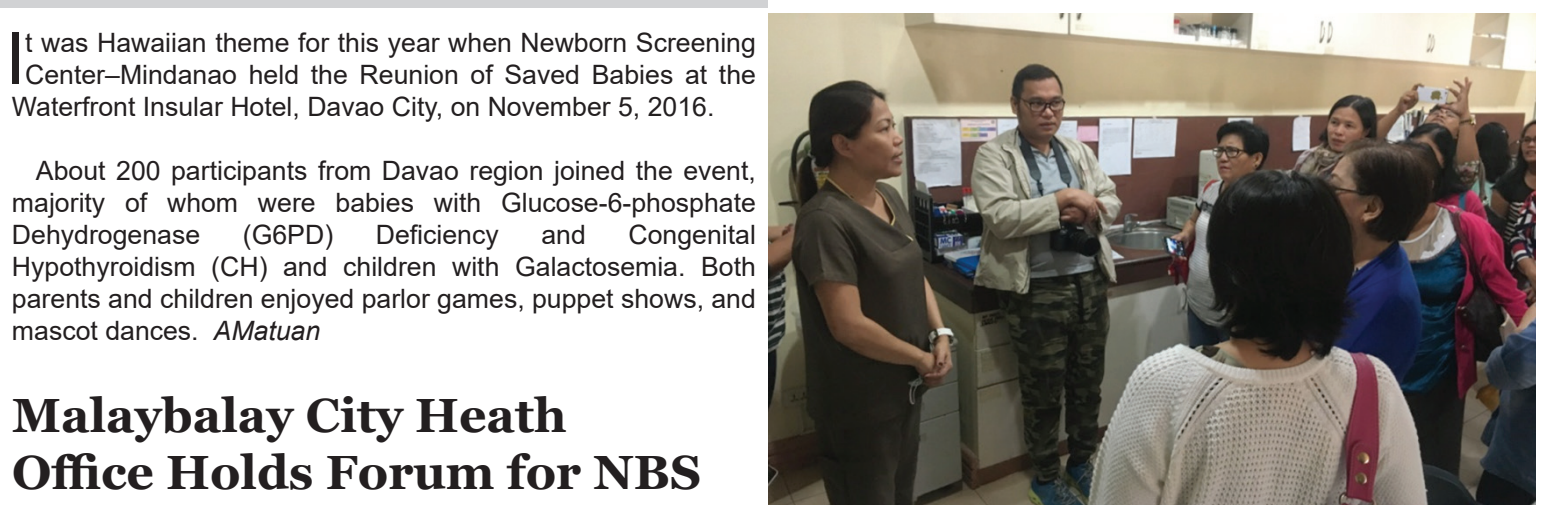
Participants conduct facility visits at Bukidnon Provincial Hospital Manolo Fortich during the NSF Assembly. To help in providing care for babies confirmed with disorders

Some 80 NBS coordinators from both private and government NSFs in the region participated in the event. Speakers from the Newborn Screening Center-Mindanao were also invited to provide developments and updates on Expanded Newborn Screening. Further, accomplishments and regional status from 2015 were also reported. GBSamante