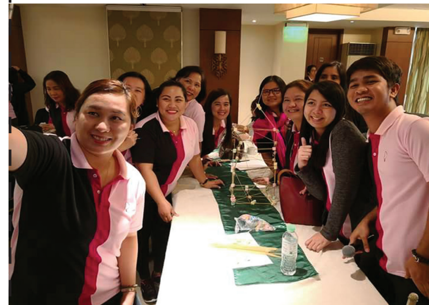
Participants of the G6PD Deficiency Forum stand by the wall where they signified their pledge of commitment to the Newborn Screening Program.

Gearing toward the full implementation of the Expanded Newborn Screening Program, DOH-NCRO organized the Annual Newborn Screening Program Implementation Review (PIR) at the Mansion Garden Hotel in Subic, Zambales, on June 13-15, 2018.