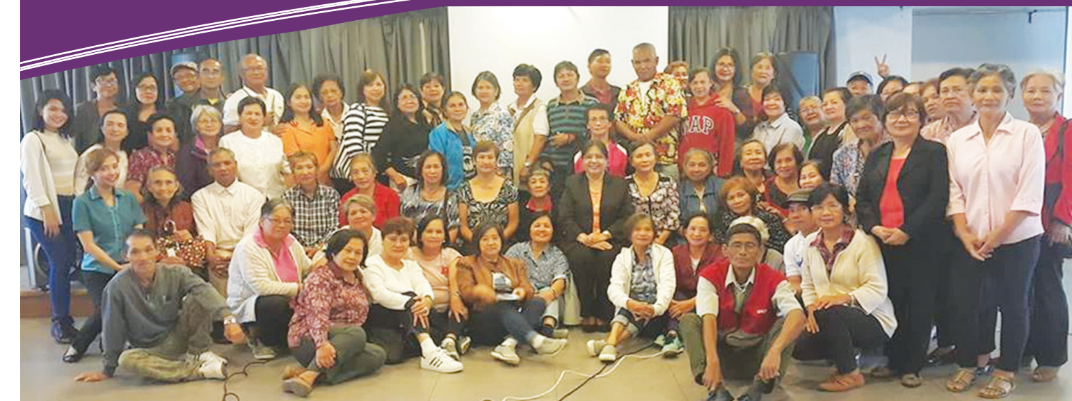
Participants of the First NBS Orientation for Senior Citizens gather together for a family picture.

newborn screening Bimonthly Publication of the Newborn Screening Reference Center National Institutes of Health, University of the Philippines Manila