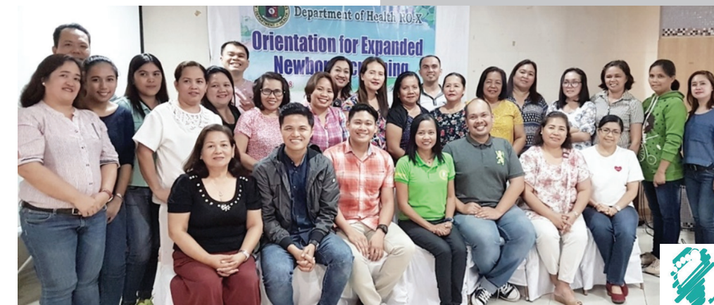
Organizers and participants of the ENBS orientation in Cagayan de Oro City

Cabading, DOH-RO 10 NBS Continuity Clinic Nurse, discussed the role of continuity clinics in the management of confirmed cases. RAguilar