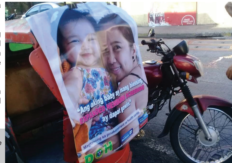
A tricycle prominently dons the newborn screening tarpaulin streamer on the front, making it easy for people and passengers to see and read the message.

The program was closely coordinated with the Health Education Promotion Officers of each city as part of their social mobilization function.