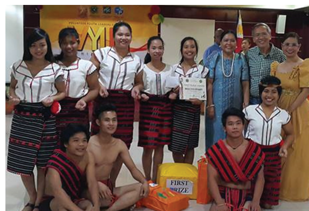
Summit participants from Ifugao Province, wearing their traditional costume, win the Cultural Dance Competition.

On the last night of the program, summit-goers participated in the Cultural Dance Competition, where Ifugao Province bagged the first prize, the University of the Cordilleras got second, and the Abra State Institute of Science and Technology, third.