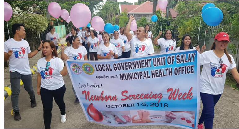
Officers and staff of LGU Salay parade through town promoting newborn

very year, NSC-M enjoins all newborn screening facilities municipalities—Balingasag, Balingoan, Lagonglong, and (NSFs), both private and government, to celebrate NBS Salav—held its first NBS Parents' Forum on October 2, 2018, Week through a Mindanao-wide NBS Campaign Contest to in coordination with DOH-CHD Region 10. Held in Salay, the encourage NSFs in the region to advocate the program more activity was attended by some 100 participants, mostly parents effectively and creatively.