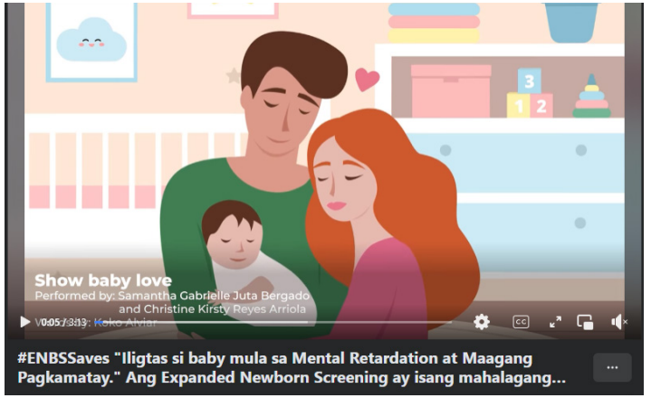
The winning video entry of Taguig city. (1st first runner up)