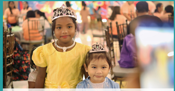
Saved Babies dressed in their best princess attire

Representatives from the Volunteer Youth Leaders for Health-Philippines were also present during the activity.