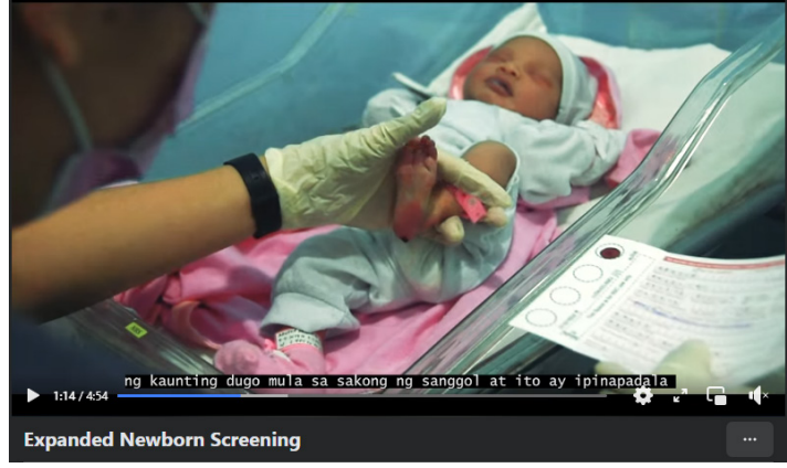
The winning video entry of Quezon City. (Grand Winner)

VIDEOS: https://bit.ly/3OSAoEd DOH-MMCHD