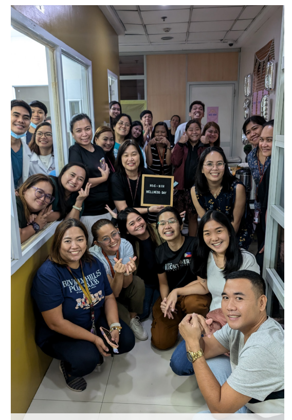
Employees of the NSC National Institutes of Health during the Wellness Day

In today's demanding work environment, prioritizing employee well-being is essential to foster a healthy and productive workplace. To celebrate the Newborn Screening Month and express gratitude for its team's hard work and dedication, the Newborn Screening Center - NIH (NSC-NIH) hosted a special Wellness Day to pamper and rejuvenate staff members while reinforcing the importance of a balanced and fulfilling work-life dynamic.